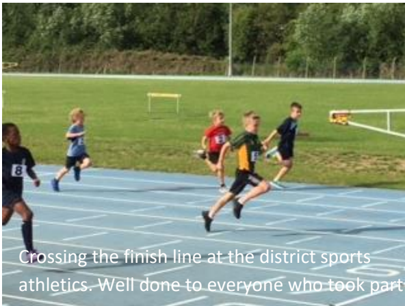
Crossing the finish line at the district sports athletics. Well done to everyone who took part